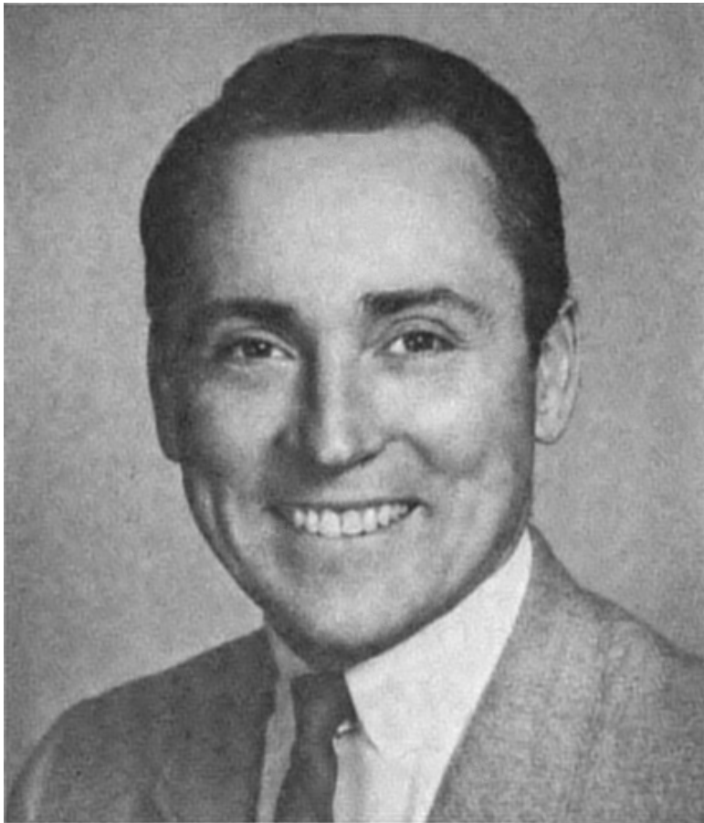
Image 3: Rep. John Conlan (Arizona). Source: Congressional Pictorial Directory (1973), 93rd US Congress, p. 12

its refereeing process was a sham. He claimed that NSF employees had the power to make whatever decision they wanted, and that they frequently ignored referee opinions. Conlan argued that the full text of all referee reports, plus the names of the authors, needed to be available to both the grant applicants and the public at large. The NSF, however, insisted that referees would not be able to offer candid feedback unless their identities were kept confidential. By this time, referees for journals and for the few funding bodies who used them systematically had grown to expect that their identities would remain a secret from the authors, and NSF Director H. Guyford Stever cast Conlan's request as a major break with scientific protocol.