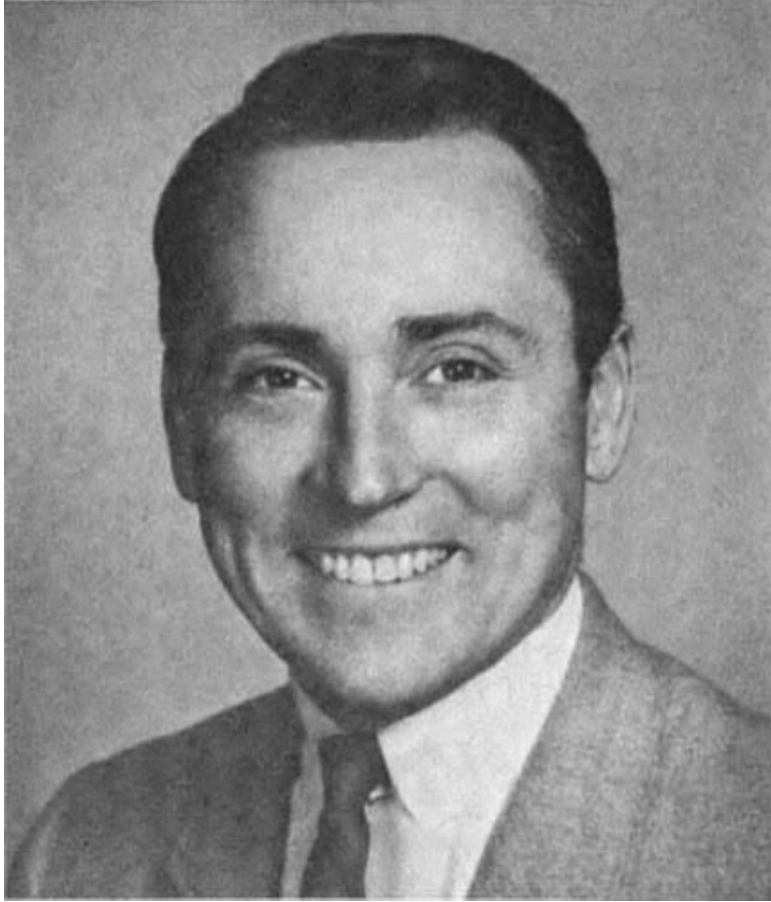
Image 3: Rep. John Conlan (Arizona).

The controversy eventually became so heated that Congress convened a hearing on the NSF's review procedures, held in July 1975. NSF leaders, including director Stever and deputy director Richard Atkinson, argued that their reviewer system was basically sound, that NSF employees did not have undue power, and that grant review had to be left in scientific hands in order to be valid. They agreed to place more weight on referee opinions and created a new audit office to confirm that both positive and negative referee reports were taken into account when making a final decision about a grant.