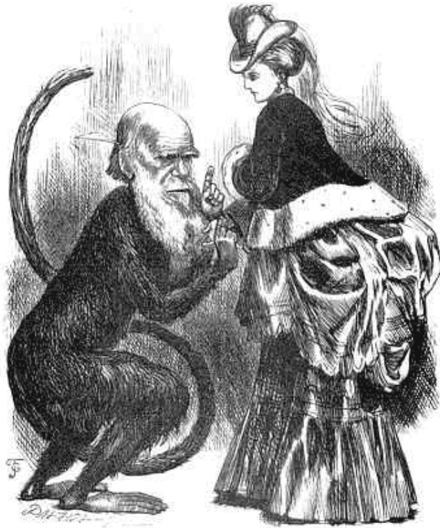
Image 2: Caricature of Darwin's treatment of Emotion.

As post-Darwinian scientific and medical practitioners focused on smaller and smaller systems and mechanisms to explain human sex difference, they repeated old patterns of gender stereotyping. Edward H. Clarke's infamous Sex in Education (1873), for instance, looked to women's shattered nervous systems as an indicator of their unfitness for higher education. 46 The turn-of-the-century discovery of chromosomes and naming of X and Y chromosomes as human sex chromosomes in the 1920s (despite other nomenclature options available) further reinforced femininity and masculinity as embedded in—and produced by—discrete biological objects. 47 The most classic example can be found in Emily Martin's path-breaking analysis of human reproduction. The "scientific fairytale" of the romance between the egg and sperm uses longstanding gender stereotypes about passive women and active men to describe how the egg, a non-participative damsel-in-distress, waits for the heroic sperm to penetrate her outer vestments. By the 1980s, developmental biologists observed that this narrative did not accurately portray human reproductive biology. In fact, the egg and sperm are mutually active partners in the process of