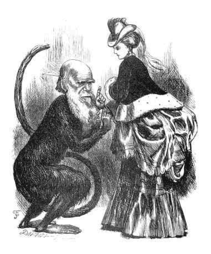
Image 2: Caricature of Darwin's treatment of Emotion.

As post-Darwinian scientific and medical practitioners focused on smaller and smaller systems and mechanisms to explain human sex difference, they repeated old patterns of gender stereotyping. Edward H. Clarke's infamous Sex in Education (1873), for instance, looked to women's shattered nervous systems as an indicator of their unfitness for higher education. The turn-of-the-century discovery of chromosomes and naming of X and Y chromosomes as human sex chromosomes in the 1920s (despite other nomenclature options available) further reinforced femininity and masculinity as embedded in—and produced by—discrete biological objects. The most classic example can be found in Emily Martin's path-breaking analysis of human reproduction. The "scientific fairytale" of the romance between the egg and sperm uses longstanding gender stereotypes about passive women and active men to describe how the egg, a non-participative damsel-in-distress, waits for the heroic sperm to penetrate her outer vestments. By the 1980s, developmental biologists observed that this narrative did not accurately portray human reproductive biology. In fact, the egg and sperm are mutually active partners in the process of