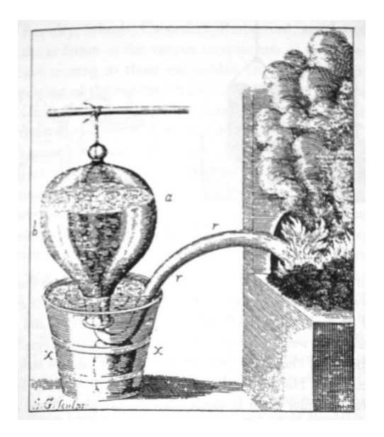
Figure 2: Stephen Hales' pneumatic trough (1727).

By the late eighteenth century, barometers and thermometers were proudly displayed in bourgeois homes. Personal diaries from this period often include daily instrumental observations of the weather. According to Jan Golinski, these habits gave rise to a modern concept of weather in the sense of the continuity and regularity of atmospheric phenomena.<sup>18</sup> Only in the nineteenth century did weather in this sense replace the study of storms, earthquakes, thunder, and other spectacular meteors as the research object of "meteorology." This quantifiable concept of weather, along with disciplined habits of observation, were the pre-condition for the emergence in the nineteenth century of the modern concept of climate as average weather.