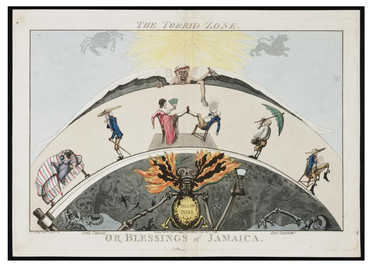
Figure 4: "The Torrid Zone, or, Blessings of Jamaica," after Abraham James, centers the colonial experience as one at perpetual risk from the effects of climate, particularly yellow fever.

as uniquely threatened by tropical climates. Physicians warned that the fates of settler colonies hinged on protecting the wombs of white women from these debilitating effects. In doing so, they propagated the myth of a feminized white climate vulnerability that required non-white labor to safeguard it.<sup>34</sup>