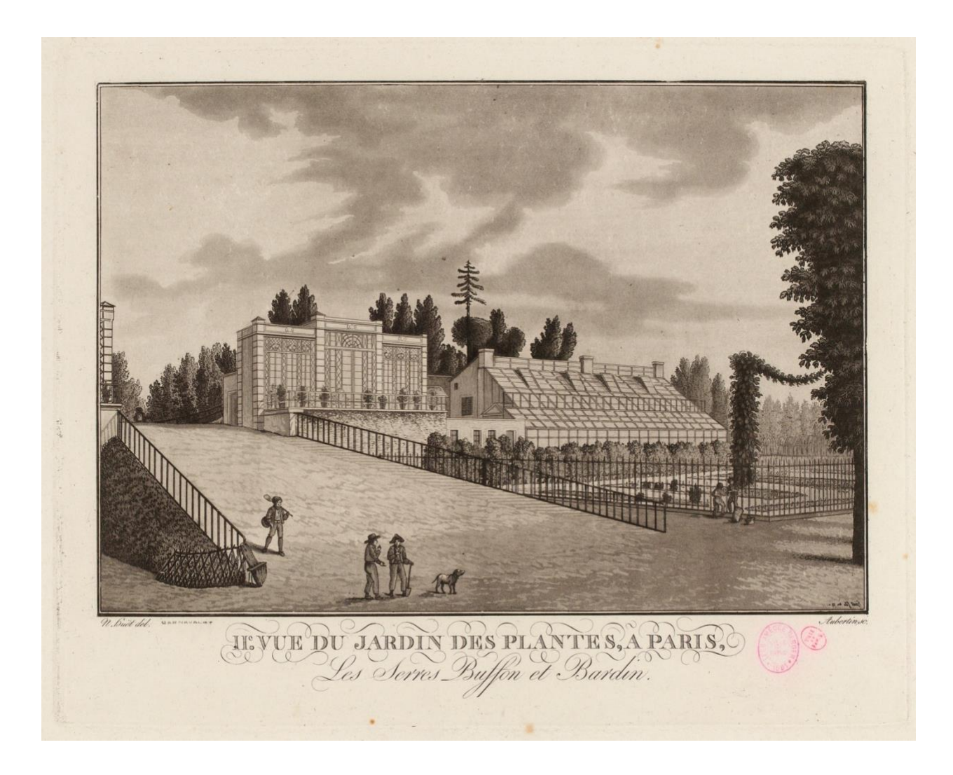
Figure 3: François Aubertin's engraving of the Jardin des Plantes in Paris emphasized Buffon's greenhouses.

Buffon's theory of the degeneration of species under unfavorable climatic circumstances was an argument for colonization and racial hierarchy, one that found echo among climate researchers into the twentieth century.<sup>30</sup> Buffon was convinced that, in the Americas, nature existed in a state of degeneration. In his view, it was the job of Europeans to restore the New World to its "original" state. This program inspired empirical research: what were the meteorological conditions conducive to humanity's original, ideal state, and how could they be engineered? For instance, Buffon argued that the spread of European agriculture would counteract the "degeneration" of climate in the Americas. We can hear echoes of Buffon